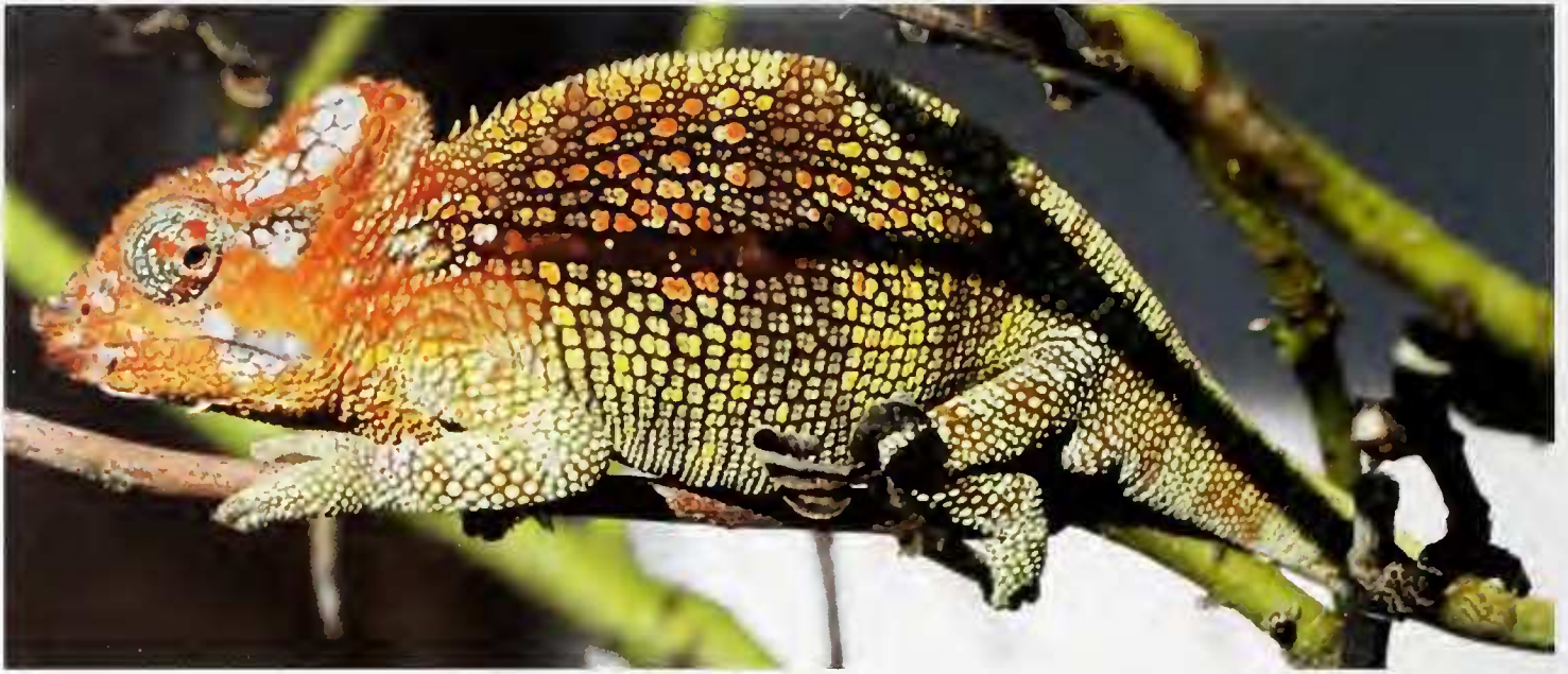
Fig. 9. A six year old K. u. artytora ssp. n. in captivity.